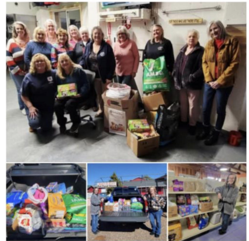
Unit 86 Pet Food Drive Fundraiser