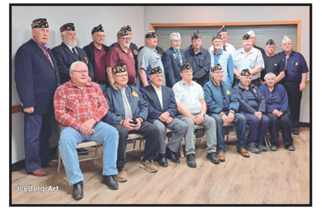
Recipients of the 'Welcome Home' coins.

Another highlight of the event was the presentation of Milestone Service Awards to Post and Unit members including a Legion 60-year and 70-year award and two Auxiliary 60-year awards.