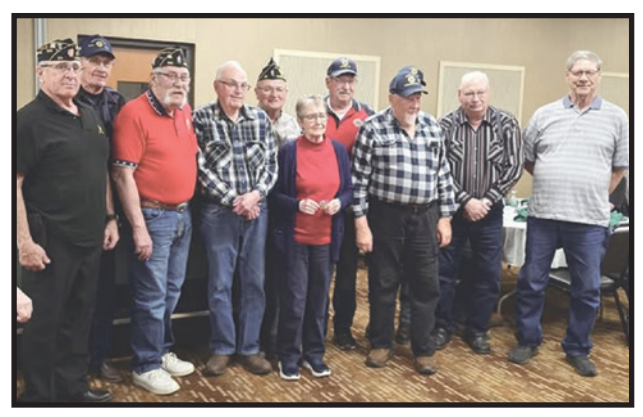
Vietnam-era veterans honored during the joint meeting.