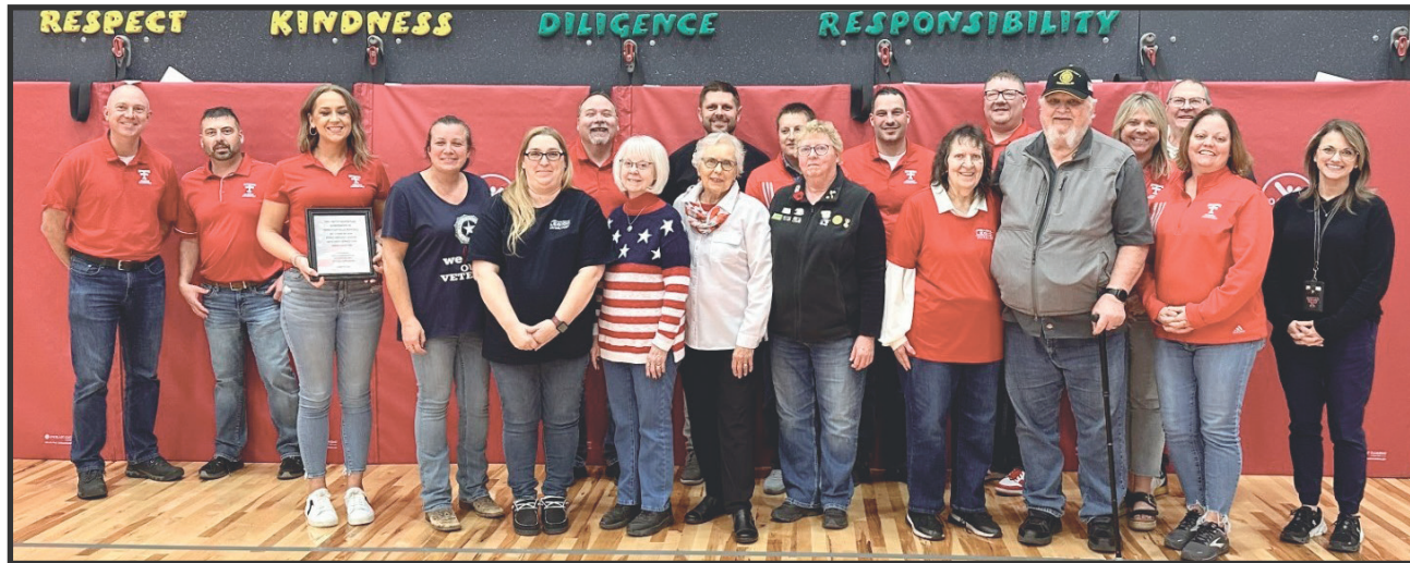
Pictured include members of Trinity Catholic Schools Administration, the Trinity Athletic Booster Club, and Unit 3 Auxiliary.