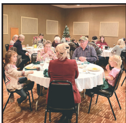
Carrington Gala Supper.