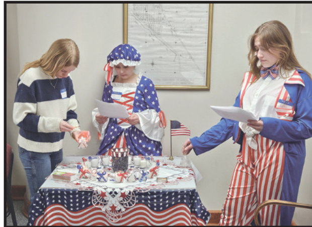
Donnybrook Auxiliary Junior members presenting memorial service at the District 6 meeting.