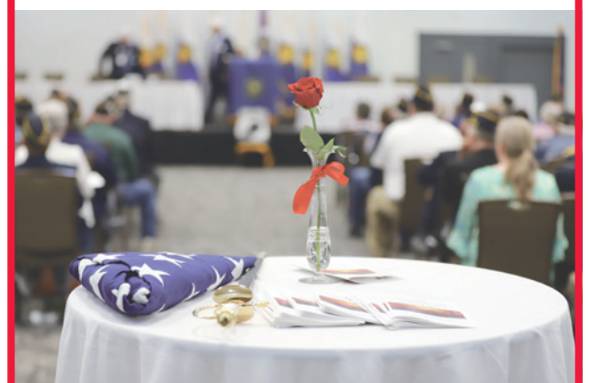
This photo and several headshots courtesy of Candace Berg / IceBerg Art

We are so proud of all participants and winners! Way to go!!