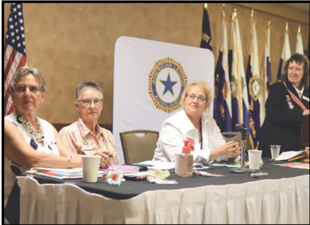
Department Leadership at Convention.