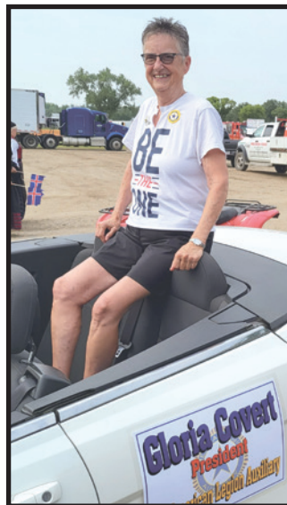
August of Deuce parade in Mountain