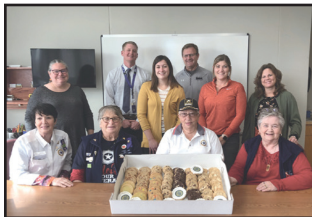
Jamestown Auxiliary members with local high school teachers.

Thank you to all teachers and law enforcement officers of Jamestown and Stutsman County for the work you do every day.