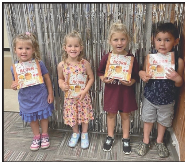
Gackle-Streeter school book recipients.