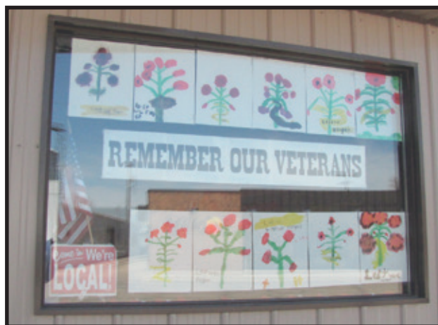
Poppy posters submitted by Grade 3 & 4 students on display at local Napoleon business.