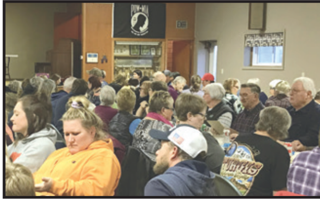
Participants in bingo and raffle fundraiser.