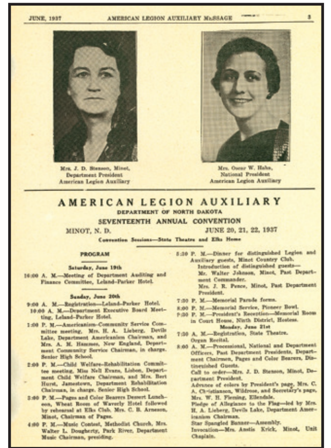
This Auxiliary Department Convention Schedule appeared in 'The Message' in June 1937.