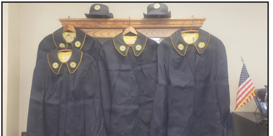
These navy blue caps and capes, donated by Gilbert C. Grafton Unit 2 of Fargo, were worn when unit members attended Auxiliary ceremonies, veterans programs, and funerals of unit or post members.