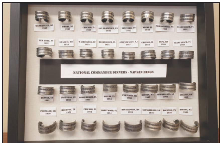
National Commander's Dinner Napkin Rings 1942-1980