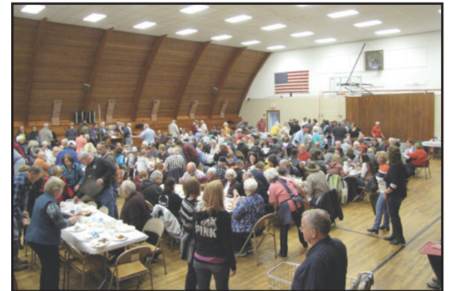
Feeding 1475 people - 200 could be seated at a setting.